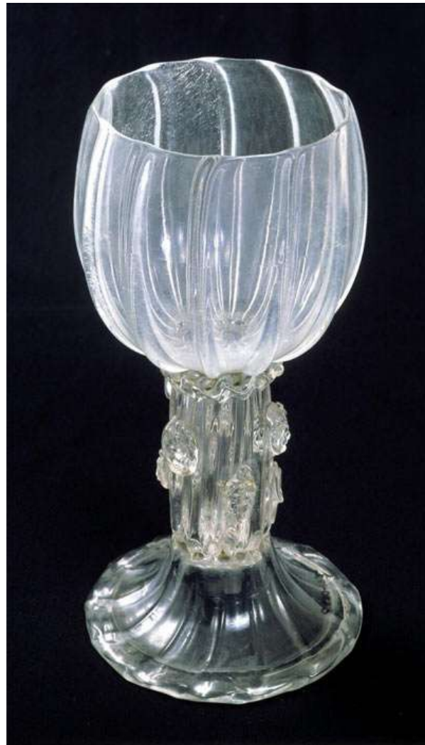
Roemer, or drinking glass, by George Ravenscroft, 1677-1677

George Ravenscroft (1632–1683) was an English businessman in the import/export and glass making trades. He added lead oxide to the glass paste. After cooking on coals and in a reducing medium, this produced a more brilliant and firmer result than the Venetian crystalline glass. His style of lead crystal glass became fashionable in England and within 20 years of his patent some 100 glass makers in England were producing lead crystal glass. Ravenscroft did not actually invent lead crystal glass, as others had already discovered the advantages of adding lead oxide to glass, but he did improve the process.