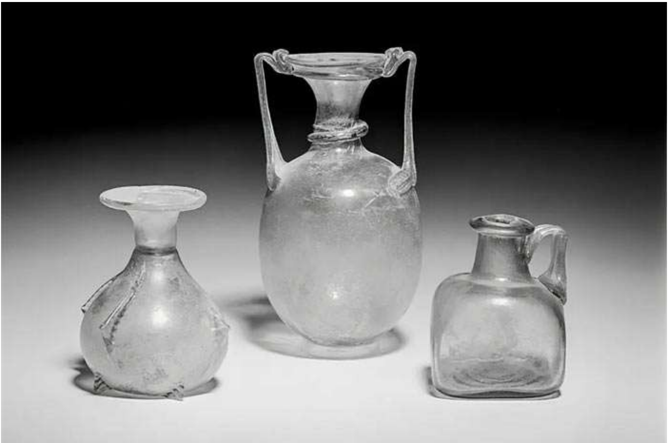
Greco-Roman Period, from Egypt in Roman imperial time 3 rd -4 th Century

It is probable that for the first time glass that came closest to rock crystal was produced in Murano, Italy. It was also called "crystalline glass" ( vetco eristalino ), to avoid confusion with real crystal. In the 13 th century, the Italian process was known in Bohemia, where materials required for manufacture were imported from the Mediterranean region. The German craftsmen succeeded to make a sodium and alum glass that was, however, less malleable than Murano's.