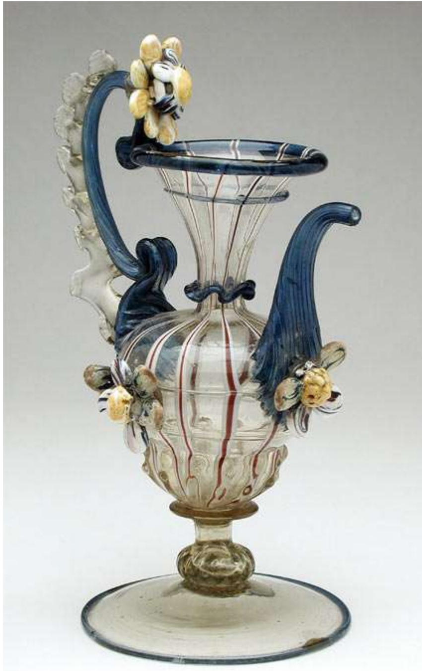
Late 17 th century Venetian glass ewer, Los Angeles County Museum of Art

In the 1670s and 1680s, Venetian glass became very popular, with its voluptuous, highly colored forms and thin-walled vessels.