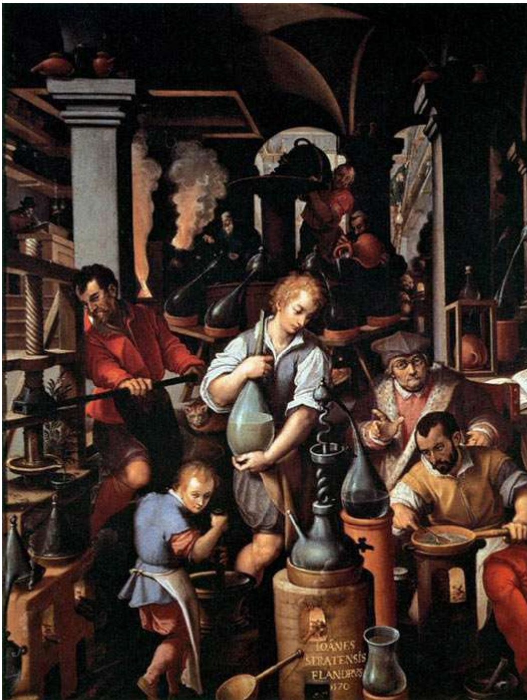
The Alchemist's Studio, by Johannes Stradanus, 1570

Around 1575, the grand duke Francesco I set up a glassworks in the Casino di San Marco, Florence, where he employed several glassmakers and alchemists. It was an alchemical research center where where artists and artisans could meet with humanists, scholars, and patrons.