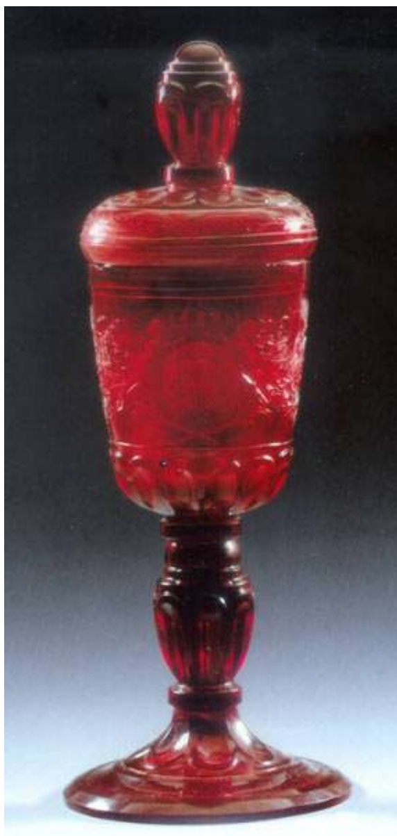
Covered ruby goblet. Kunckel's shop, Brandenburg before 1691. Hamburg, Museum für Kunst und Gewerbe.