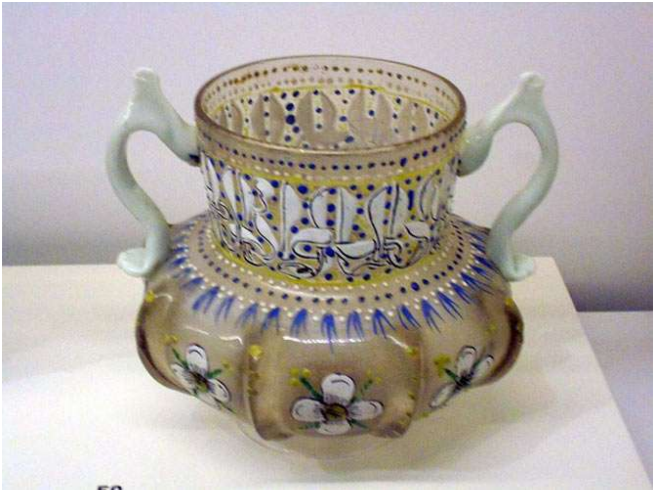
Catalan glass vase from around 1500