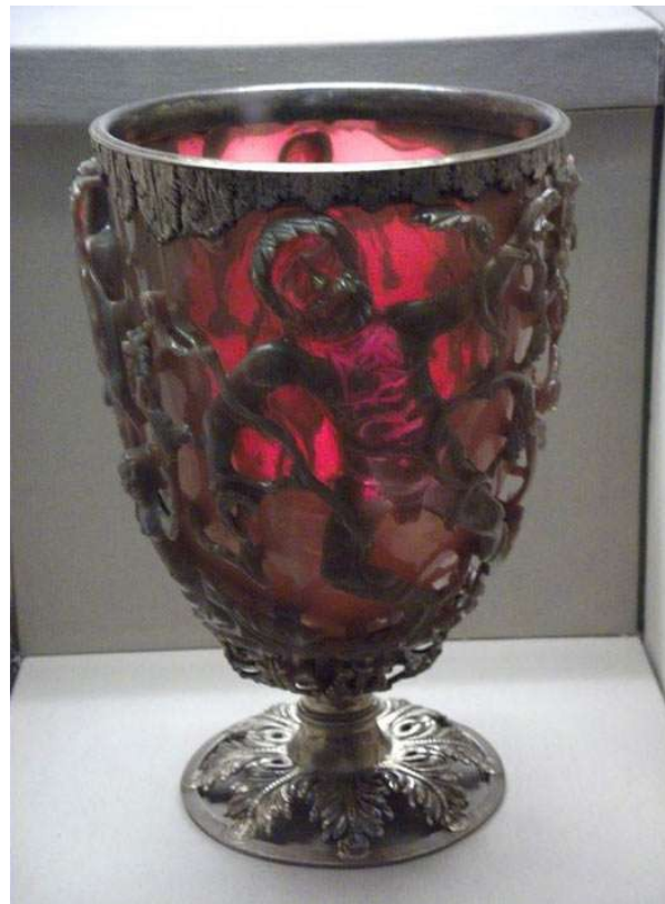
The Lycurgus cup

We can go even back further and find that deep red glass was made by the ancient Egyptians and Romans. The color was produced by a colloidal gold solution prepared by dissolving gold in Aqua regia. An example of this is the famous Lycurgus cup, a late Roman (4 th century) glass cup that is made of cut glass and is displayed in the British Museum in London. This cup looks green in reflected light, but appears red when light is shone through it. This effect is due to the colloidal dispersion of gold and silver nanoparticles.