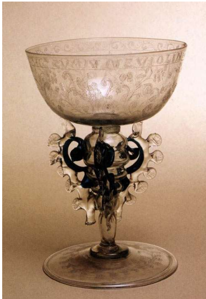
Drinking Cup from 1550-90 in Transparent glass, Museo Poldi Pezzoli, Milan

Since the 12 th century the glass makers of Florence (Firenze) had already distinguished themselves in the production of luxury glass. They had inherited glass making secrets from the Byzantines and the Arabs, with whom they had close relationships. These works of art were primarily intended to be distributed to other sovereigns as gifts whose inestimable value was conserved only for so long as the Medici laboratories managed to retain the secret of their production. De Medici family was well-known for their interest in alchemy and funded alchemical laboratories.