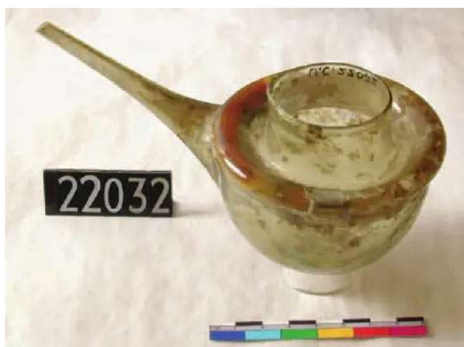
Glass alembic. Egypt. University College of London at the Petrie Museum, University College (London). Inv. UC22032.