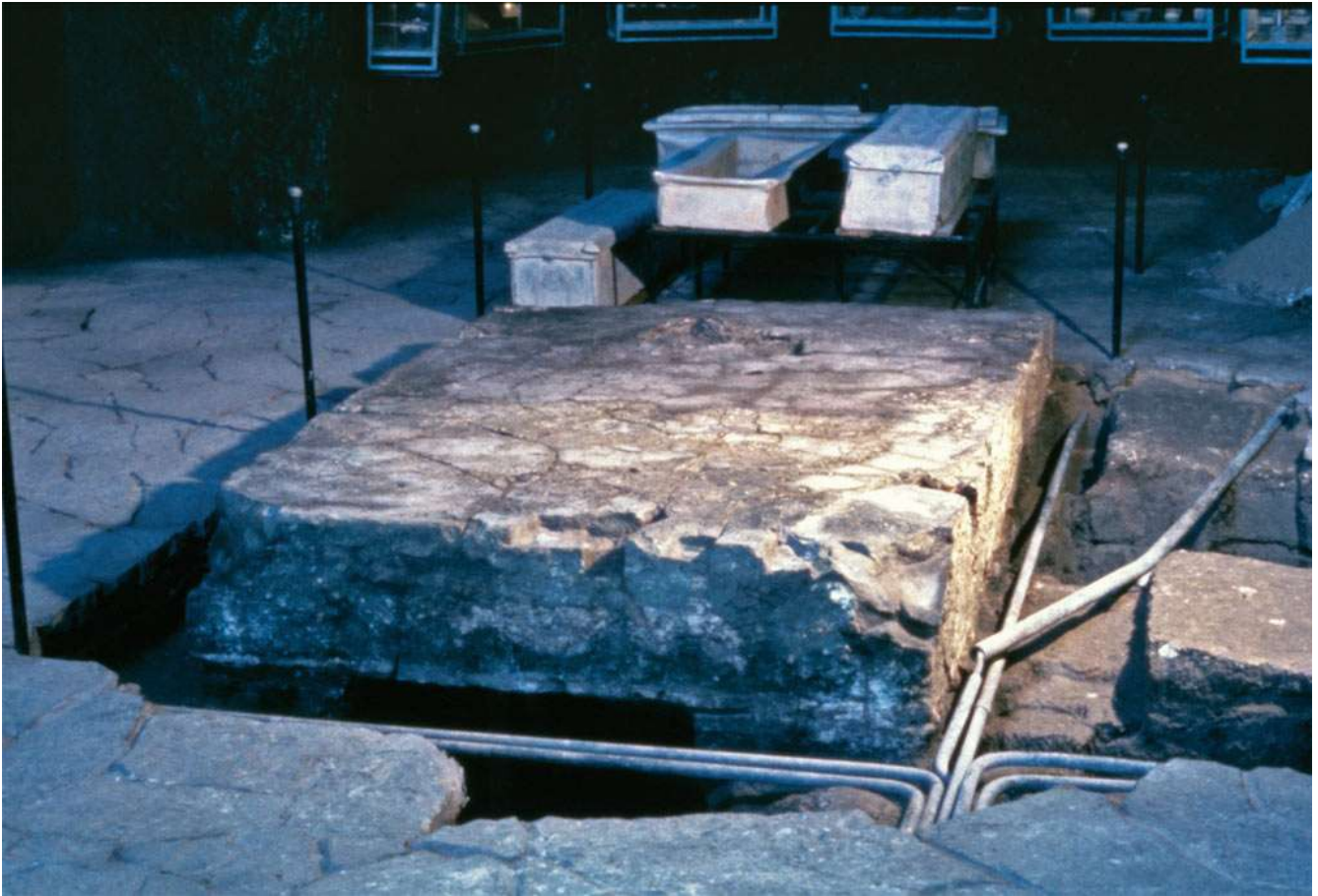
The Beth She'arim slab of glass.