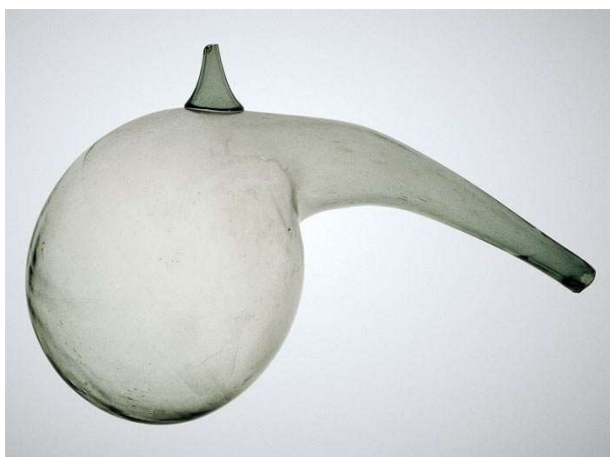
Retort, 18 th century, Corning Museum of Glass