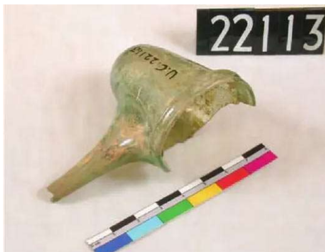
Glass head of a still, excavated in Egypt. Late Roman Period ? Petrie Museum, University College (London). Inv. UC2213.

The following two pictures give you an idea of the ancient Egypt alchemical glassware: