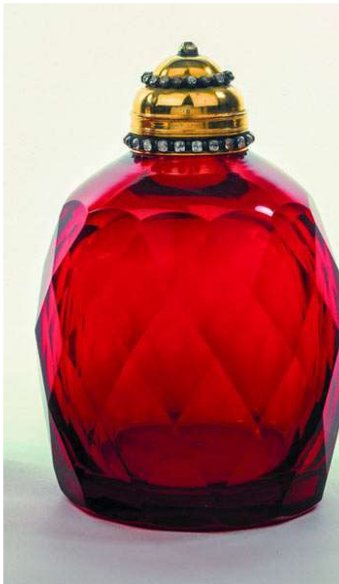
God ruby glass specimen from around 1700, from Staatliche Museen zu Berlin, Kunstgewerbemuseum

Other alchemists tried to produce a red colored glass, such as the Hamburg physician, Andreas Cassius, who in 1676 reported his discovery of the red coloring properties of a solution of gold chloride, subsequently called purple of Cassius. This was a beautiful purple-red color, which was also highly regarded as since ancient times purple was a royal color, and sometimes also associated with the philosopher's stone.