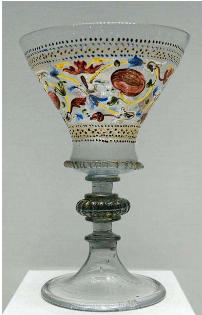
Enameled cristallo stem glass, around 1500

According to Garnier, the crystalline glass of the Barovieri owed its "whiteness, purity and translucency to the use of Egyptian or Syrian soda, together with smelting with crushed Tessini boulders." This soda was obtained by burning an herb, "al-kali", which came from the East via Alexandria. Interestingly, according to Glauber, a 17 th century German alchemist, "Alkhest" or Universal Solvent was required in the achievements of the great work. Apparently Alkahest was any sort of solvent. As can be seen, the alchemy remains close.